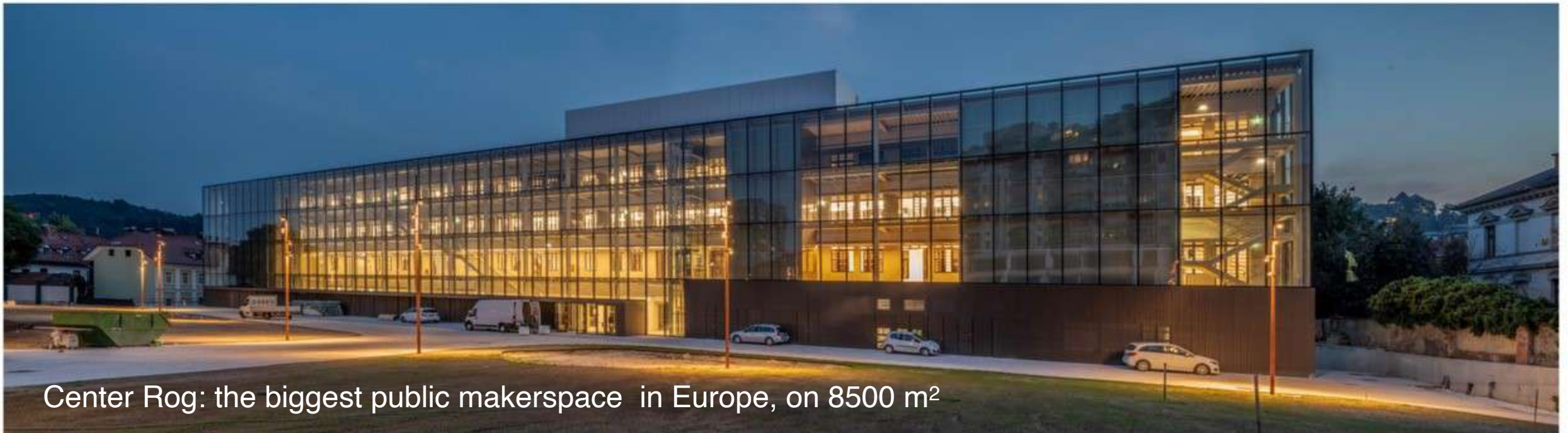
Center Rog: the biggest public makerspace in Europe, on 8500 m 2