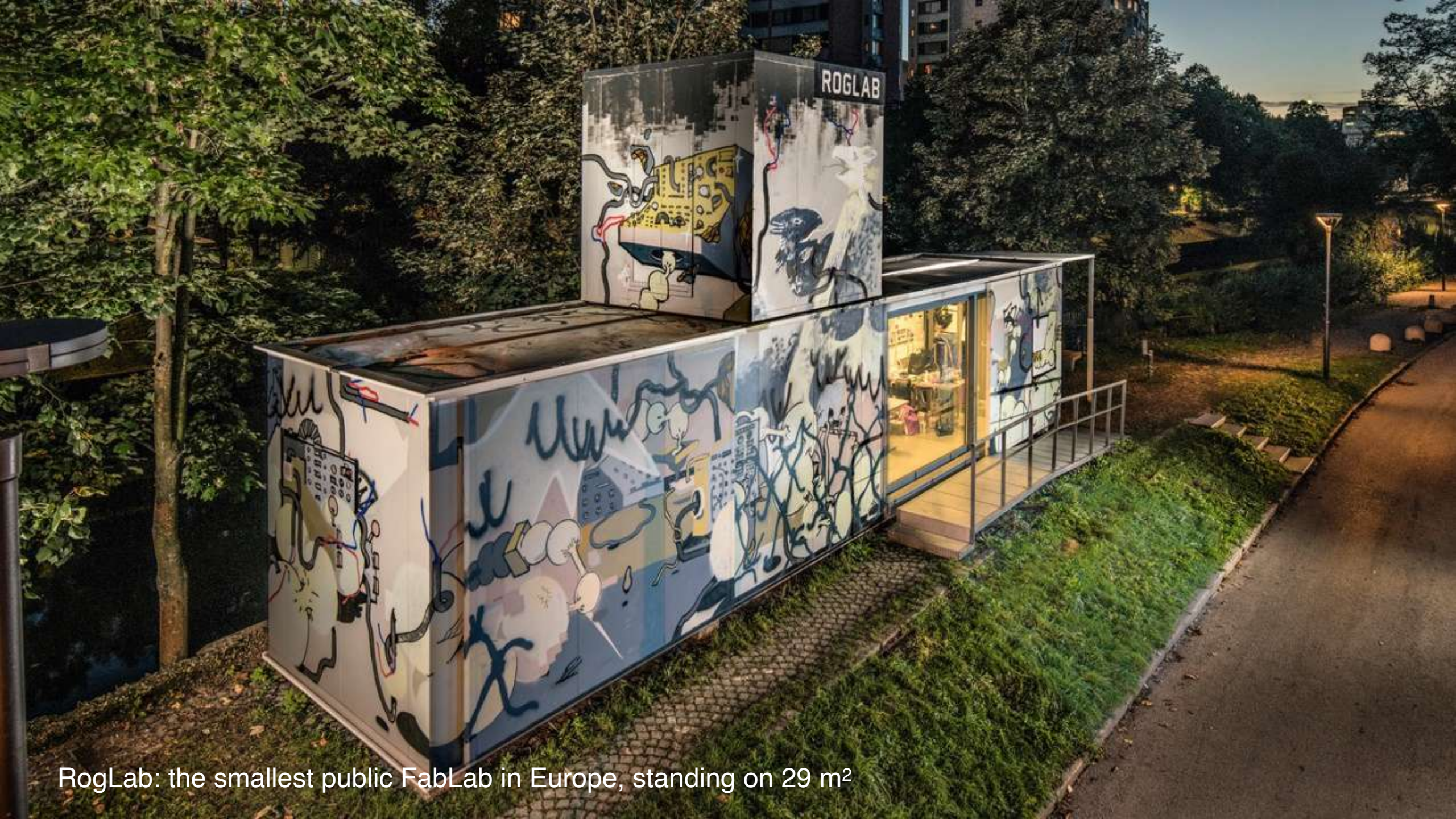
RogLab: the smallest public FabLab in Europe, standing on 29 m 2